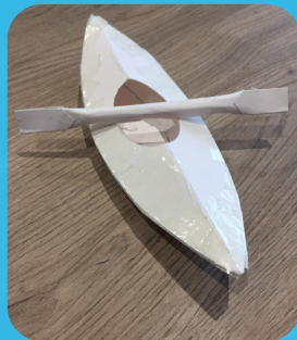
Make a Kayak