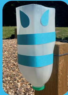
Make a Mini Water butt