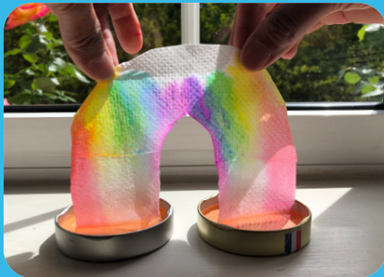
Grow your own Rainbow of Hope

Choose one of the following activities to complete. Full instructions to complete each of the challenges below are located at https://www.scoutfoundation.info/h2o-2020