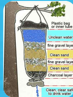
Build your own Water Filter

Send us a photo of your creation when complete to safeguarding@scoutfoundationni.org.uk for sharing on our PUBLIC Facebook page.