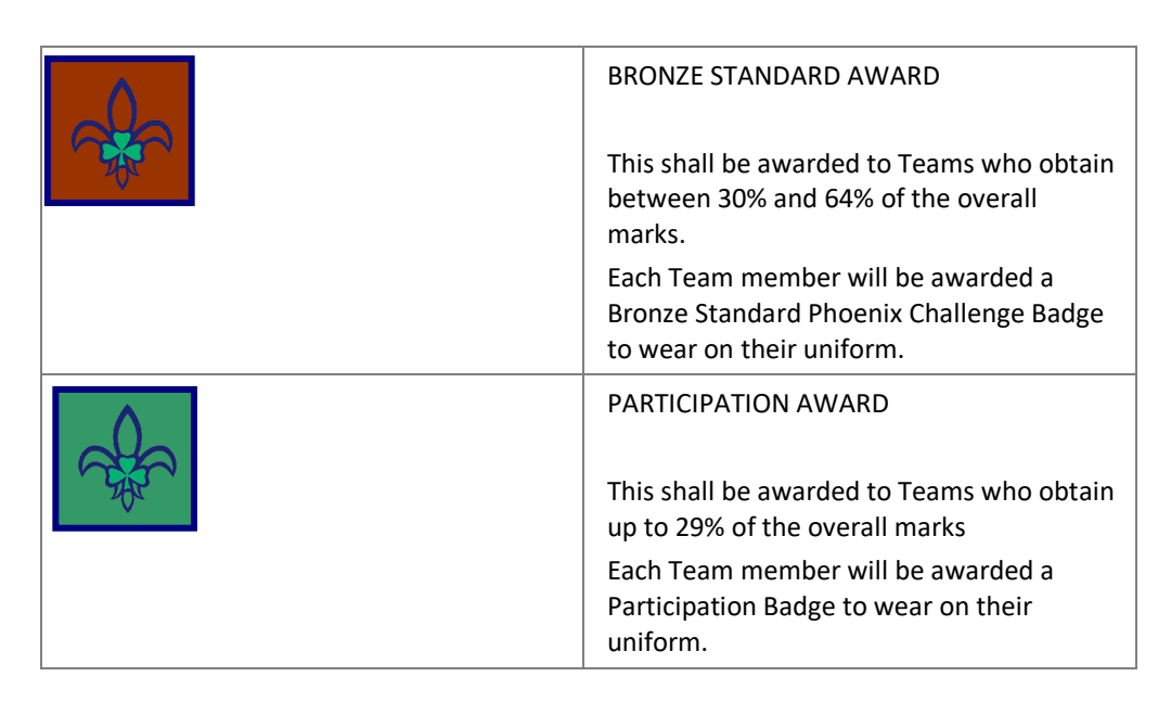
Table 3 Phoenix Award Standards