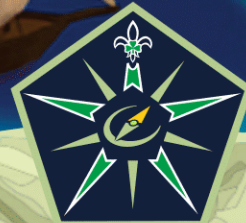
CHIEF SCOUT AWARD